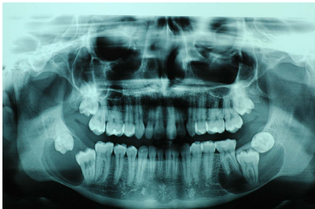
Figure 2. CBCT of odontogenic development cysts formed around impacted teeth in mandible.

sac, leading to the formation of cyst, may result from the pressure on vessels occurring during the tooth eruption. The pressure may lead the blockade of venous return and accumulation of fluid and reduction of follicle's epithelium. Second theory suggests that, epithelium surrounding tooth germ combines with remnants of inflammatory radicular cyst of primary tooth. Remnants of radicular cysts after combining with follicle sac lead to transformation to pathological dentigerous cyst. Third theory suggests, that epithelium surrounding tooth germ transforms after stimulation by bacteria from local inflammation in periapical region of primary root. 4