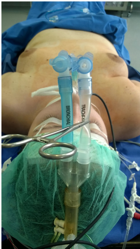
Fig. 2 – WLL procedure using double-lumen tubes for lavaging each lung in order to physically remove the accumulated alveolar lipoproteinaceous material.

remained (Fig. 4a and b). Due to persistent respiratory insufficiency, subcutaneous GM-CSF 300 mcg daily was started immediately and continued for 12 weeks.