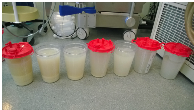
Fig. 3 – A total of 12 L of warmed (37 °C) saline were used for WLL. The lungs were washed until the solution appeared clear.

At the end of treatment, the patient's clinical and laboratory signs of respiratory insufficiency disappeared, and her lung function was clearly improved ( DL_{CO} – 62%). Decreased ground-glass opacity and crazy-paving was noted on a CT scan, including the upper left lobe, which had remained affected after WLL (Fig. 4c and d).