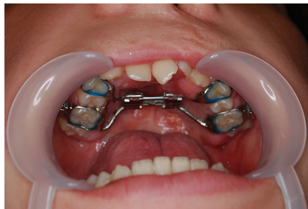
Fig. 1 – Correction of the maxillary narrowing in patient after cleft of primary and secondary palate using Hyrax device.

The complications observed during the application of orthodontic-orthopedic palatal expansion methods including teeth extrusions, lateral tilting of the teeth and alveolar