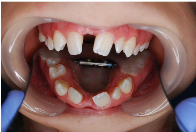
Fig. 2 – Correction of the maxillary narrowing using UNI-Smile distractor.

Indications for SARPE include cross bites, crowding accompanied by contraindications for teeth extraction, large side corridors in adult patients, patients over 14 years old (although the limit of age is still under discussion), preparation for orthognatic surgery reducing the risk of incorrect alignment of bone fragments and instability of the surgery