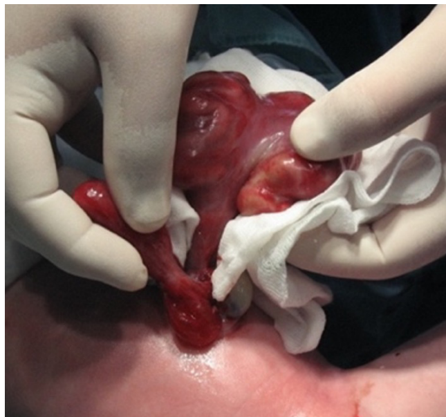
Figure 1. Intestinal gastroschisis.

New-borns with congenital gastroschisis require specialist postoperative care, including mechanical ventilation (MV), total parenteral nutrition (TPN), and the treatment of possible complications. The survival rate of new-borns