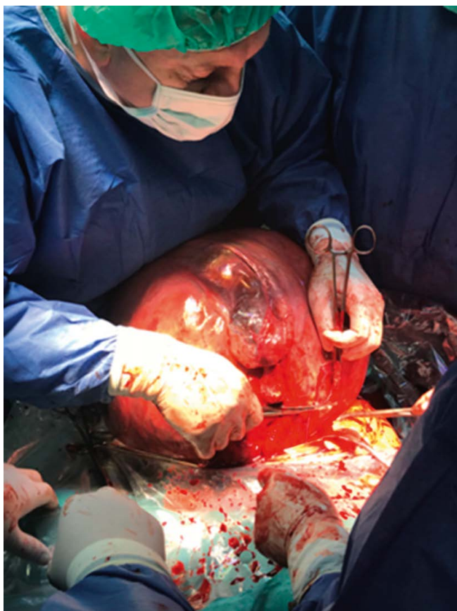
Figure 1. Intra-abdominal view of enlarged uterus.

tumor. No air was found under the diaphragm domes or fluid levels in the intestinal loops. Preoperative laboratory testing revealed an elevated level of red blood cell parameters (Hb 19.4 g/dL, RBC 6.33 \times 10^{12}/L , HCT 58.3%) and Ca-125 105.3 U/mL. A haematological consultation was held. Because of increasing pain and difficulties with urination, defecation and breathing, the patient was qualified for laparotomy. Before the surgery, we asked for anesthetic consultation to protect the patient's vital functions. After the anesthesiological preparation of the patient, catheters were inserted into the right: radial artery, right internal jugular vein and right femoral vein. The surgeon was a gynecologic oncologist. An abdominal midline vertical incision was made and the huge tumor with a diameter of 35 cm arising from the uterus, stretching and modeling the abdominal wall, occupying the space from the pelvis to the diaphragm was observed. Two assistants were needed to lift and fix the giant tumor, secure the surgical field, and prevent vascular rupture. The myoma surface was smooth, hard, with many dilated veins.