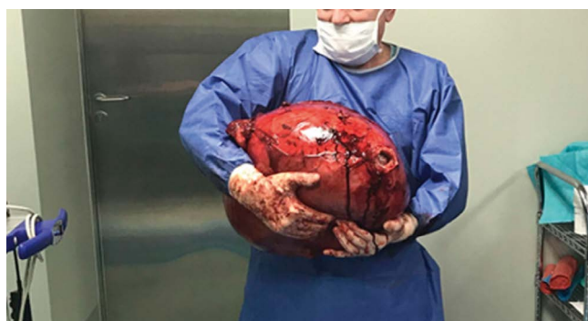
Figure 3. Presentation by the operator of removed uterus.

the procedure, where she was sedated and mechanically ventilated for one day. On the next day, the general condition of the patient was stable and she was transferred to gynecology department. Histopathological examination of the tumor revealed leiomyoma. The patient was discharged from the hospital on the day 9 after the surgery and recovered without any incident.