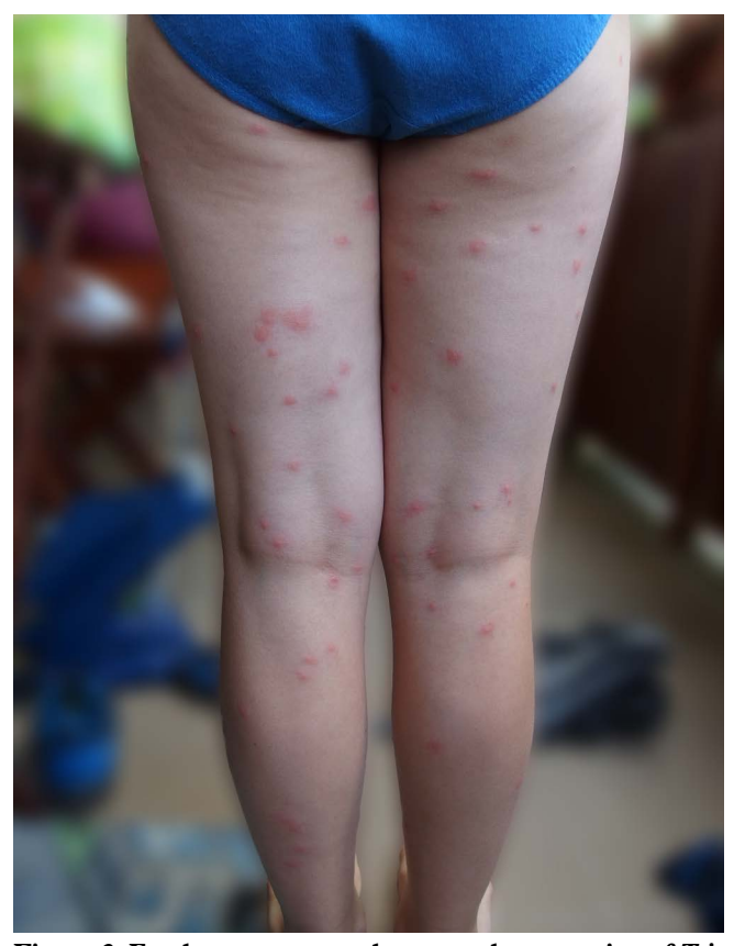
Figure 2. Erythematous papules cause by cercariae of Tri chobilharzia sp. (1 day after infection).

first or repeated exposure to the pathogen.<sup>22</sup> Skin lesion are most commonly seen on the legs, torso and forearms.<sup>13</sup>