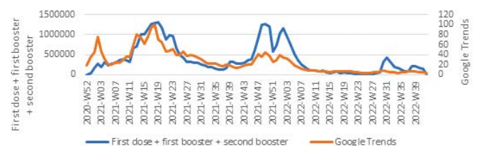
Figure 3. Weekly number of queries related to the topic of vaccination in Poland relative to the sum of the number of COVID-19 vaccinations (first dose and first and second boosters) administered in Poland from the 52 nd week of 2020 (i.e. December 27) through the 39 th week of 2022 (i.e. September 26 – October 2). The designations on the category axis indicate the year and week in a given calendar year.

The increase in the number of vaccination-related queries in Poland (Google Trends) coincides with an increase in the total number of COVID-19 vaccinations (first dose and first and second boosters) administered in the country in the period from week 52 of 2020 (i.e. December 27) until the 39 th week of 2022 (i.e. September 26 – October 2). Peaks in the number of queries related to the topic of vaccinations measured with the Google Trends tool were observed in the second week of 2021 (value: 75), and then in the 18 th week of 2021 (i.e. May 3–9) and week 49 of 2021 (i.e. December 6–12), taking values respectively: 100 and 45. In contrast, the highest sum of vaccinations administered was observed in week 19 of 2021 (i.e. May 10–16), the 49 th week of 2021 and the 2 nd week of 2022 (i.e. January 10–16), taking the values respectively: 1,300,638; 1,269,642; 1,162,083 (Figure 3). Kendall's tau coefficient showed a positive statistical association for the analyzed variables ( \tau = 0.62 ). However there was no direct correspondence